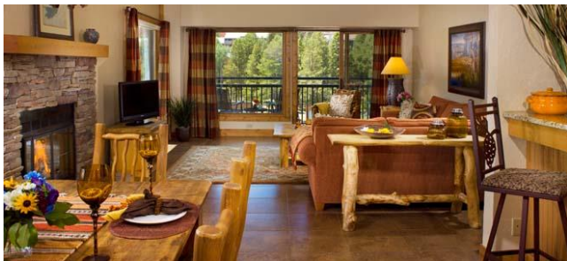
Figure 1. The interior of the suites is very nostalgic regionalist, incorporating design cues from the Native American and gold mining history of the region.

The interior of the suites are full to the brim with traditional and regional decorations. Overall, the rooms have a very rustic color scheme, with off-beige walls and earthy red, brown, and beige curtains as seen in the background of figure 1. All of the sidings are finished in a neutral light brown, bringing out the natural colors of the wood. To add to the regional feel, each