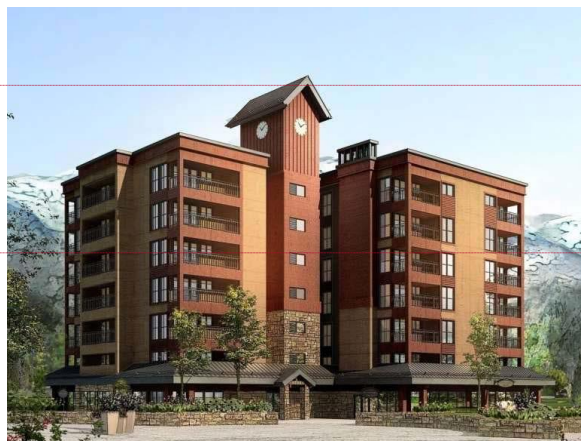
Figure 3. The exterior of the buildings is very simplistic and rectilinear, only showing the heritage and culture of the region in its color palette.

The exterior of the buildings is far removed from the traditional style found inside. Instead of organic forms and natural theme, the lines are crisp and sharp and very rectilinear, as shown in figure 3. Across all of the condominium buildings, there is not a single curved edge to be seen. Every window, every balcony, every protrusion fits together neatly into a grid pattern with clearly defined rows and columns. Its simplistic forms minimize the cost of building the complex, at the cost of losing the Rocky Mountain feel. Arguably, if the buildings were moved into a city anywhere in the country, it would not look out of place. Thus, convincing someone that The