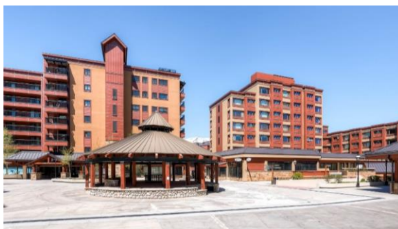
Figure 4. The surrounding modernist buildings only serve to further highlight the regionalist style of the fire pit.

figure 4. It is hard to miss as it is in the plaza in the middle of the complex, and it has a distinctive faux-traditional feel to it. It is the only structure in the complex to be round rather than rectangular, and boasts a wood-burning fire pit with