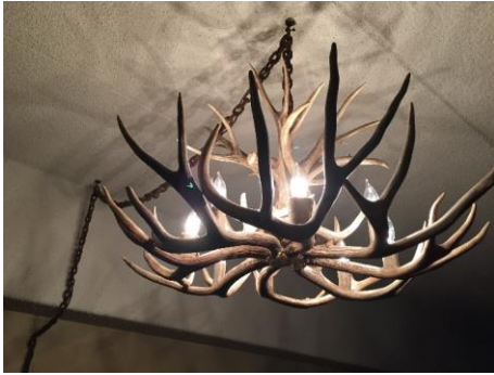
Figure 2. The chandelier is quintessentially regionalist in its use of actual antlers from local animals, reminding the viewer of the physical place of the Rocky Mountains.

of native people and animals to the viewer. Also hanging from the walls are faux-traditional tools made in a vintage (c. 1850s) style, such as wooden skis decorated with traditional motifs and snowshoes made of woven fibers. In the bedrooms, the story is much the same with bedframes made of sturdy pine logs and sheets and comforters carrying the same earthy color