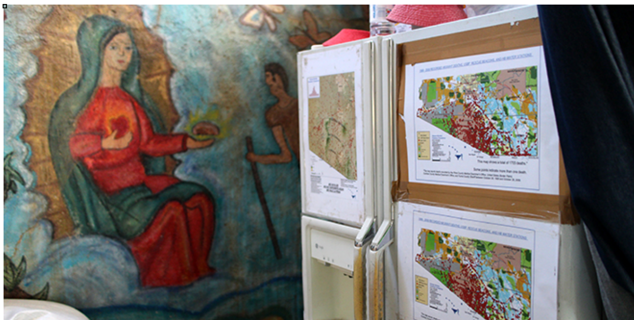
Figure 3. Maps of migrant deaths and aid-stations in the southern Arizona desert displayed inside a migrant shelter in Nogales, Sonora, Mexico.

In this light, the federal policies and interventions to enforce border protection in the U.S. have made the process of undocumented migration into the United States much more dangerous, in too many cases leading to bodily harm, deprivation, or death, while not always functioning as the strict barrier to entry they were intended to encapsulate. Furthermore, the “funnel effect” (Rubio-Goldsmith et al. 2006) that was intended to discourage migration and lower the numbers of undocumented migrants willing to make the more dangerous journey around the fenced areas has not been effective in practice. Migration numbers increased dramatically after the Border Patrol’s strategic initiatives were launched with “Operation Blockade” (subsequently renamed “Operation Hold the Line”) and “Operation Gatekeeper” in 1993 and 1994, respectively, and even as migration rates have leveled out in very recent years, the number of reported migrant deaths has continued to increase or at least remain steady.