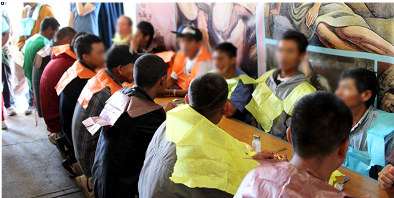
Figure 1. Migrants gather for a meal at a migrant day shelter in Nogales, Sonora, Mexico.

Sitting at a picnic-style table in the shelter on Mother's Day, we watch dozens of migrants eat breakfast quietly after an introduction by a Sister of the Eucharist who has come to address the important role of mothers in the lives of the migrants. At one table, women sit quietly together. Some of them are mothers whose U.S.-born children (therefore legal U.S. citizens) are on the other side of the border. They are separated by the Wall, and by an impossible immigration system that offers them no legal recourse to rejoin their families other than attempting to cross the border clandestinely. Most of the migrants are men, and they occupy much of the rest of the room. The shelter's concrete floor and chain-link walls, covered with banners to keep out the sun and the prying eyes of "coyotes" and their recruiters. It provides a small bit of respite from the confusion, danger, and crisscrossing surveillance that exists just outside its doors. A Jesuit Priest urges those in the room to "keep moving" because the border area in and around Nogales is a dangerous place for migrants; at the border, they are vulnerable to abuse by criminals, human and drug traffickers, and even local police (who, shortly after our fieldwork, raided one of the sleeping shelters and robbed migrants of many of their possessions, resulting in the shelter closing temporarily).