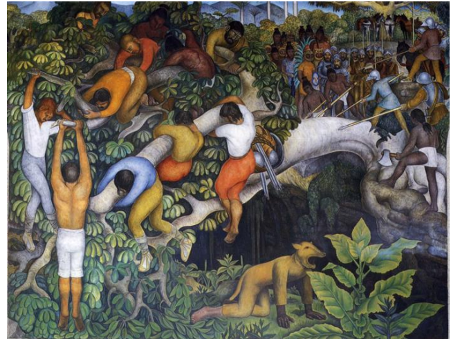
Fig 2 - The History of Cuernacava and the Morelos - Crossing the Barranca (1929-30) by Diego Rivera, Cortez Palace, Cuernacava

at Cortez Palace. (Fig 2) First, the swelling curvature of the forms is an element of Rivera's stylization. The bodies seem to expand at important places in their motion, such as the shoulders if they are holding on to something, and the back if they are bending over. The limbs are bent in an unnaturally smooth manner, and the musculature and fleshiness of the bodies is magnified. In