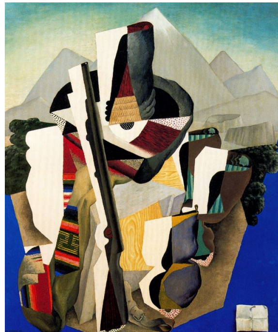
Fig 4 - Zapatista Landscape (1915) by Diego Rivera, oil on canvas, Museo Nacional de Arte, Mexico City

[An in-depth analysis of Rivera’s cubist works and experiences will commence here. I will begin to use my other books, which more closely examine Rivera’s cubist portraits and other pieces at the time, in addition to the Craven biography which is really the only main source I’ve used so far. I’m looking forward to getting more perspective and looking more closely at individual paintings and experiences he had in Europe.]