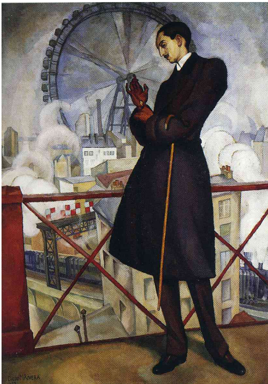
Fig 3 - Retrato de Adolfo Best Maugard (1913) by Diego Rivera, oil on canvas, Museo Nacional de Arte, Mexico City

Wolfe asserts that Rivera “regarded cubism as the most important experience in the formation of his art.” (25) However, while he was working alongside European artists, he simultaneously found his voice as a Mexican artist and began to incorporate more Mexican and indigenous themes in his work. (38) Some of his most important works include Retrato de Adolfo Best Maugard (1913) and Zapatista Landscape (1915). (Fig 3 and 4)